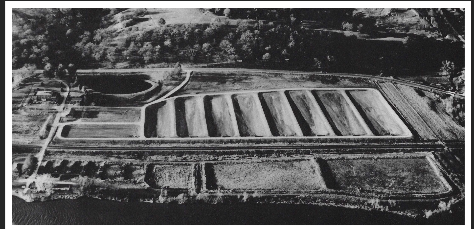
Aerial overview of hatchery showing new pond construction in mid-1950s, facing north.